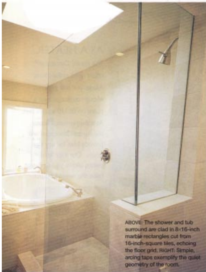
ABOVE: The shower and tub surround are clad in 8x16-inch marble rectangles cut from 16-inch-square tiles, echoing the floor grid. RIGHT: Simple, arcing taps exemplify the quiet geometry of the room.